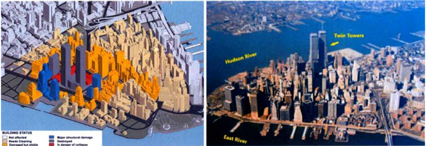
Caption: On Left, graphical blueprint of the damages caused on the World Trade Centers and other surrounding buildings and structures. On Right Picture taken in 1982 of Lower Manhattan of New York city, citing the Hudson River, East River and Twin Towers.